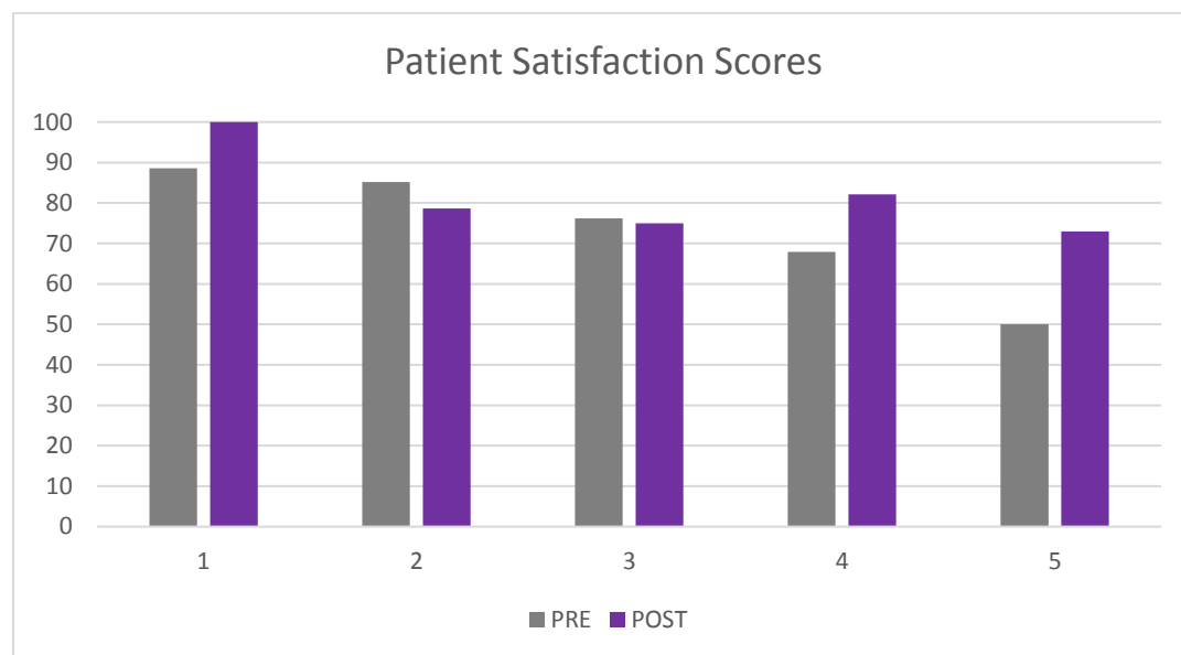
Figure 4. Patient Satisfaction Scores

Figure 4 illustrates patient satisfaction scores for the five months pre- and post-implementation of the Orthopedic Nurse Navigator role.