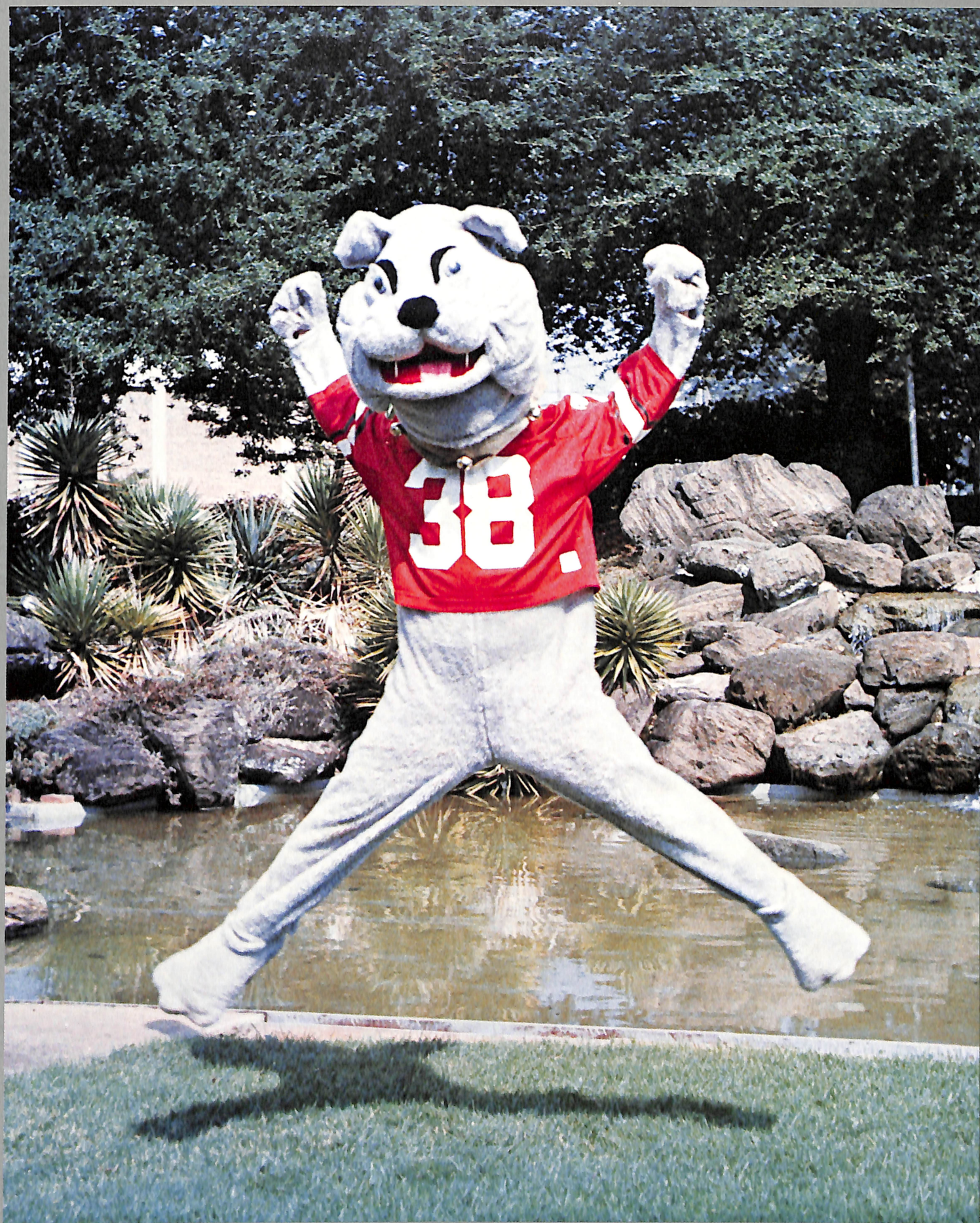
MASCOT - BULLDOG