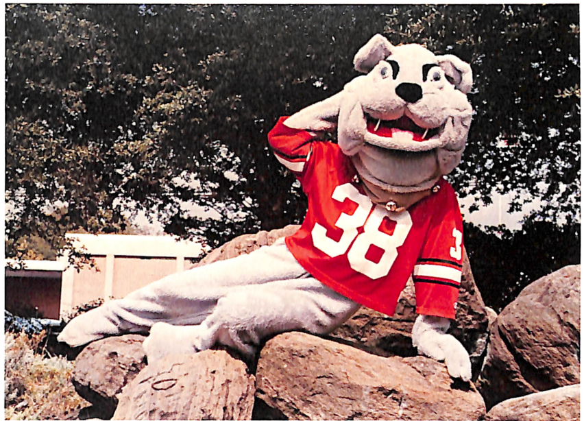
p. 56 student portraits