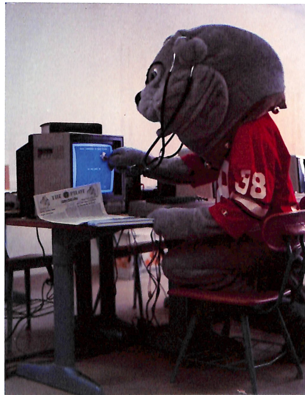
p. 138 organizations