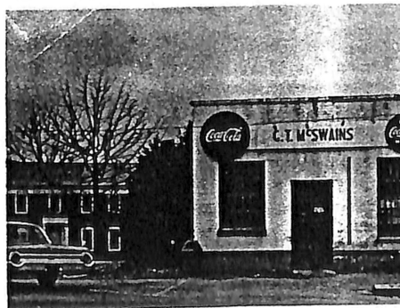
THE G. T. McSWAIN Store stood for decades on the corner of the entrance to the Gardner-Webb campus. The college purchased this site when the McSwain's store was moved to a new location around three years ago. The store building has been torn down and with the new entrance construction there will be a "boiling springs" fountain and pool on this site.