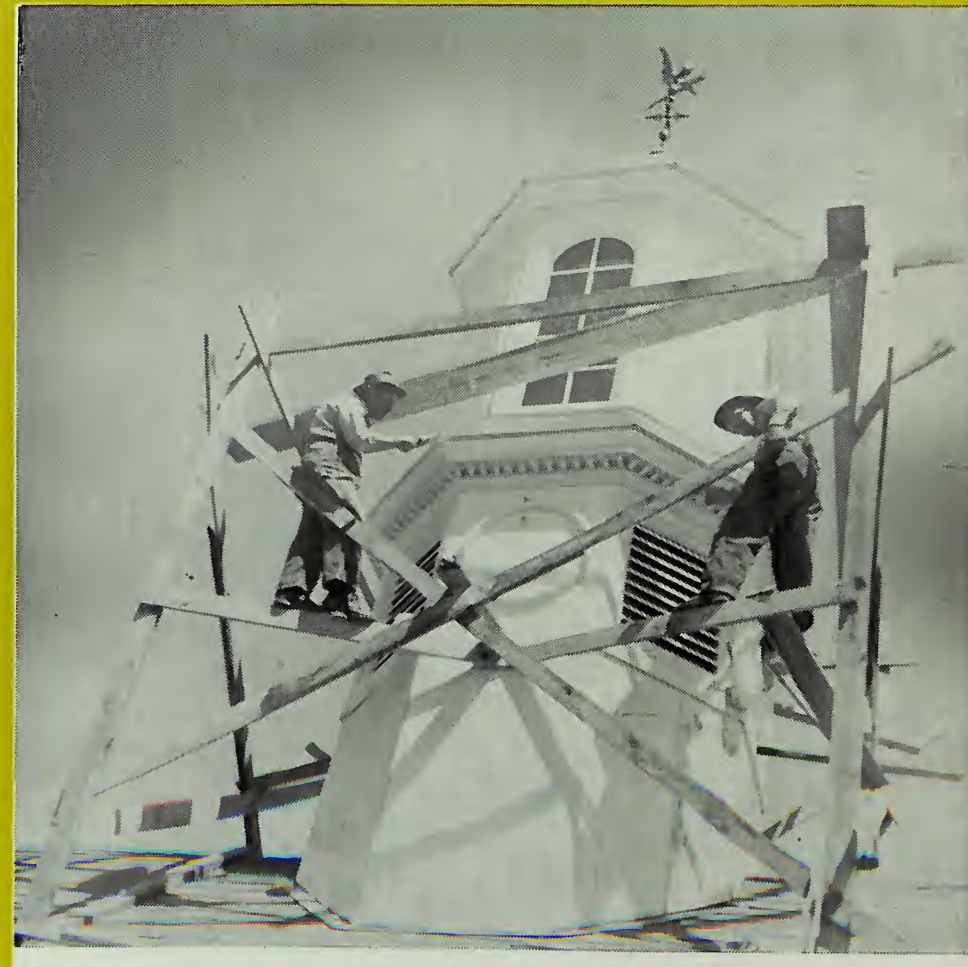
Face Lifting For College Landmark