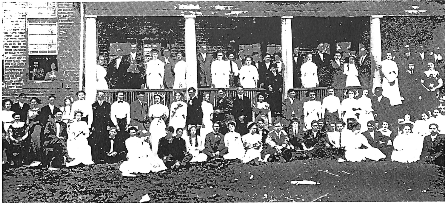
HUGGINS - CURTIS BLDG