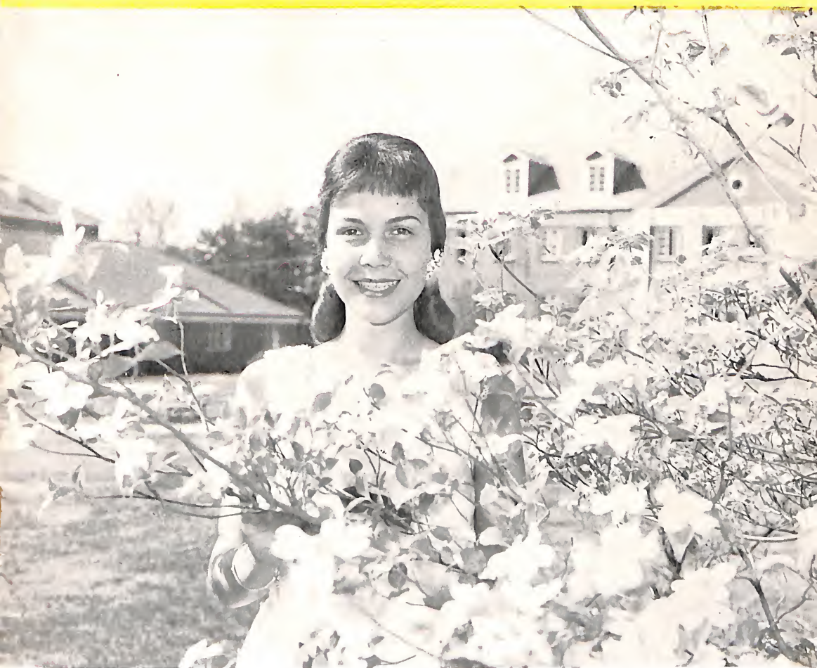
May Queen And Dogwoods