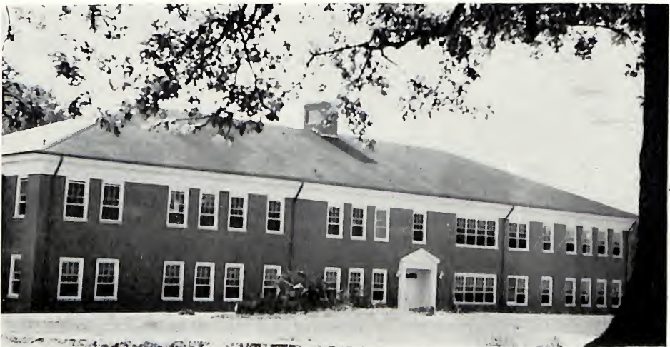
. . . New Science Building

In part, he said, "It is our hope that this building will enable us to better accomplish the . . . purpose of our department . . . to acquaint the student with the basic laws of the physical universe . . . . We seek to assist the student in finding truth through the study of science and in verifying known truths by experimentation . . . ."