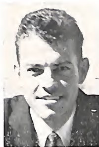
. . . Churchill