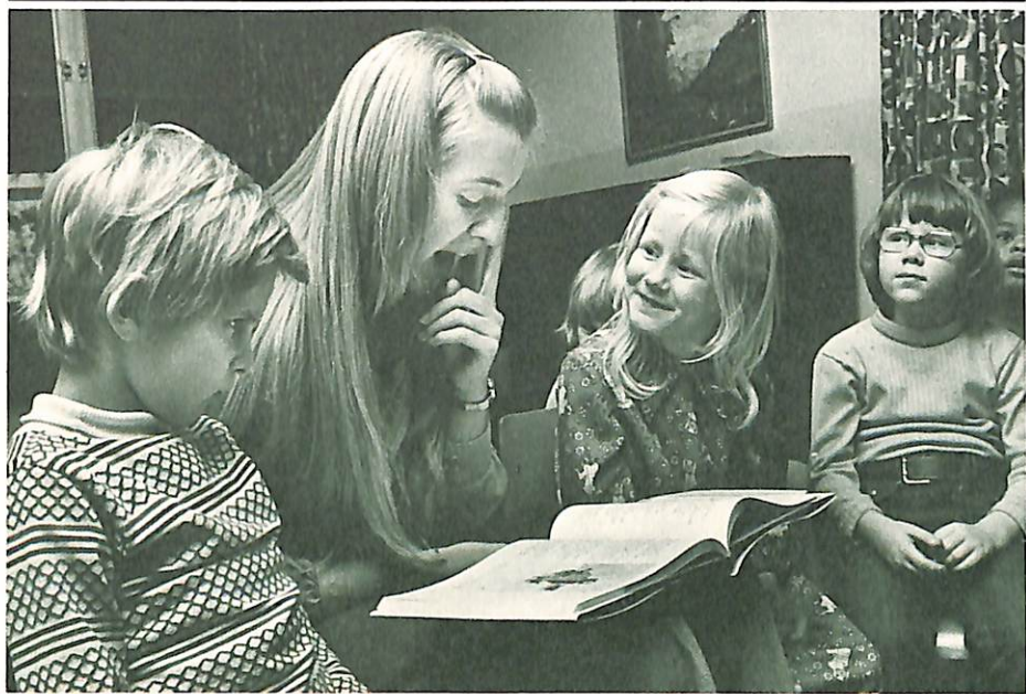
Reading to children at Governor Morehead School for the Blind

"... Inasmuch as ye have done it unto one of the least of these . . . ye have done it unto me."