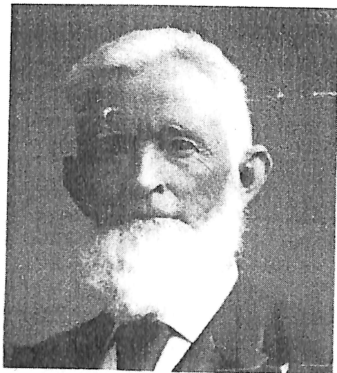
REV. THOMAS DIXON, JR. OF NORTH CAROLINA