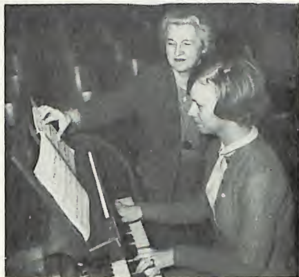
Music—Listening And Learning