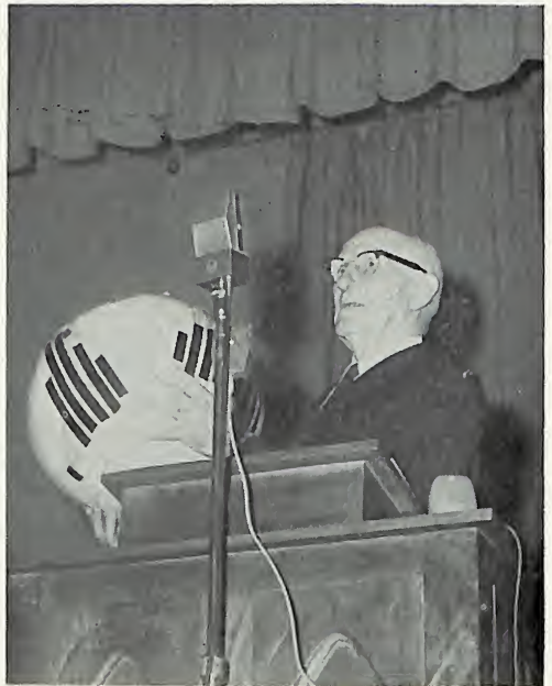
Dr. Frank Laubach