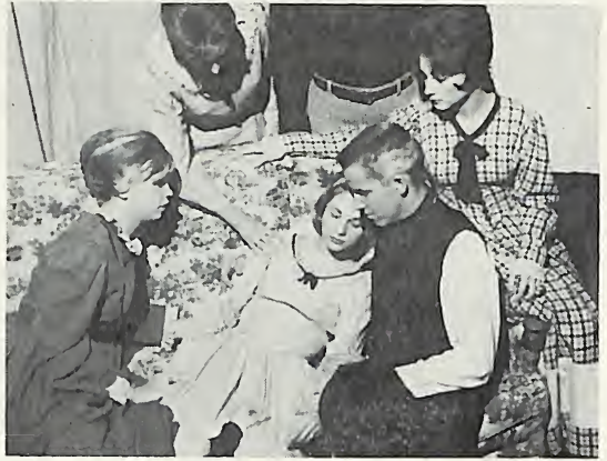
Playcrafters Present 'Little Women'