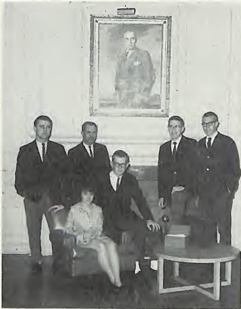
1963-64 Was A Great Year