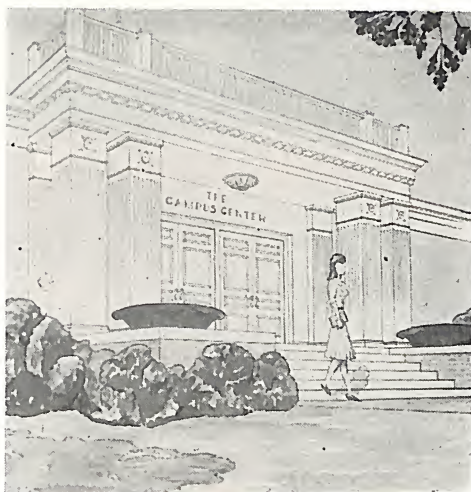
Front Of Proposed Student Center, Cafeteria