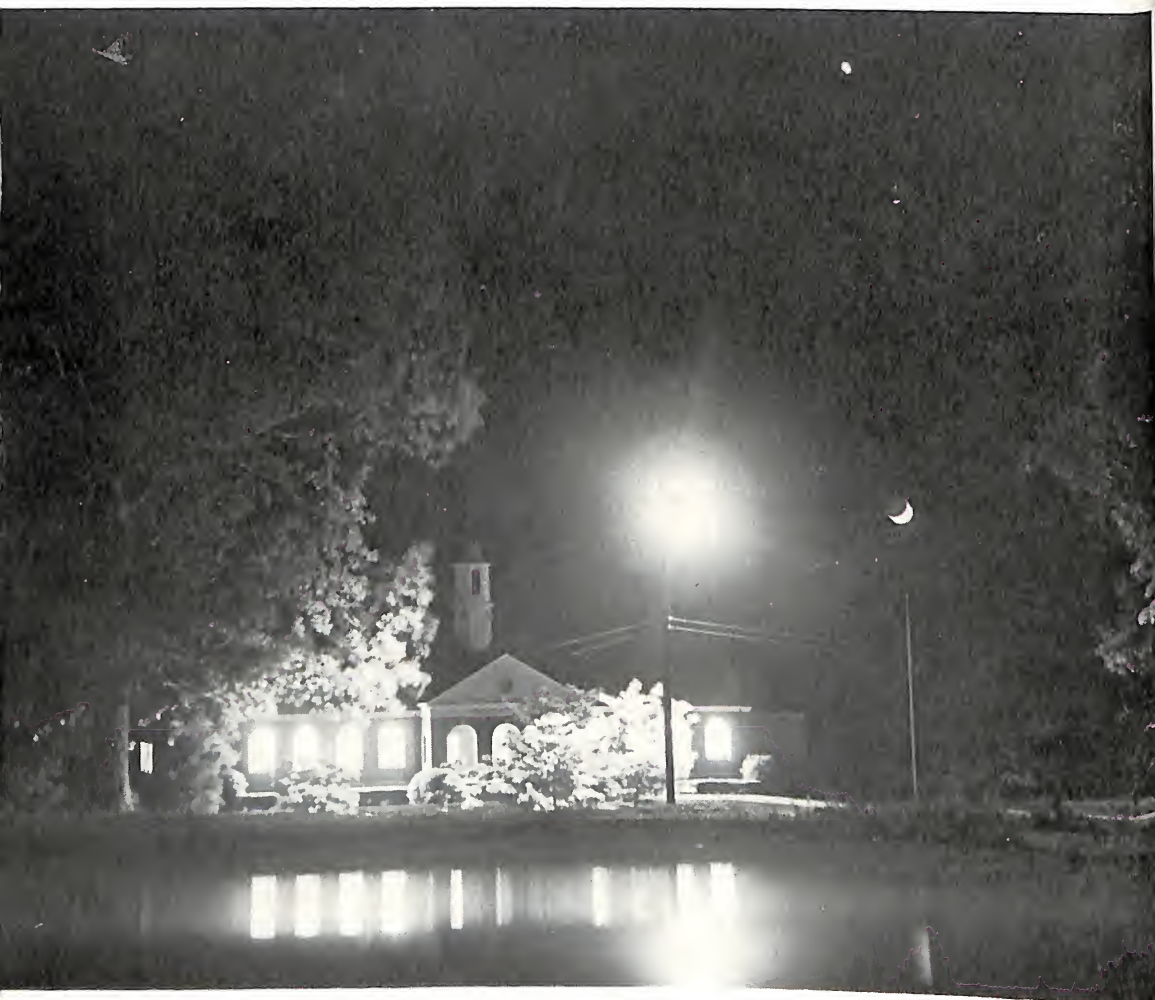
Lights In The Darkness — Keep Them Burning