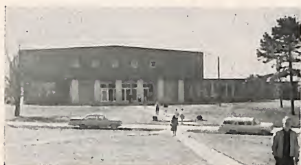
Bost Physical Education Building