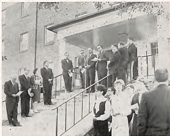
New Men's Dormitory Is Formally Opened