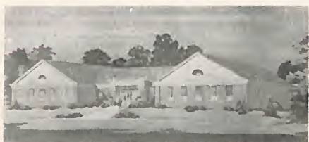
Charles I. Dover Campus Center