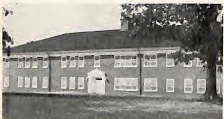
A. T. Withrow Science Building

Three buildings at Gardner-Webb College have been named for supporters of Christian Education in this area. Two Cleveland County and one Mecklenburg County family were honored in the action by the college board of trustees in January.