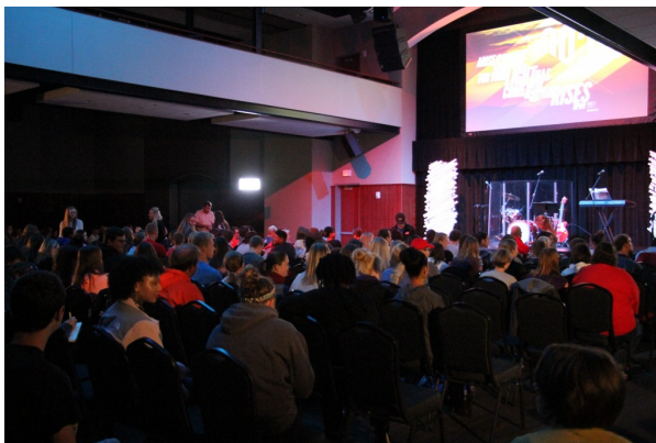
Students at The Gathering.