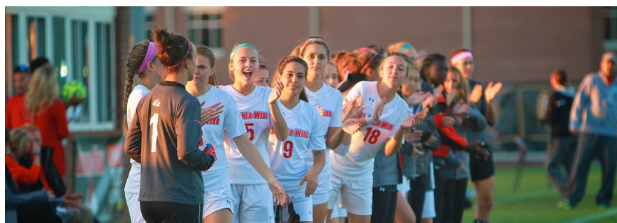
Women's Soccer vs. Campbell; Fall 2014

Please navigate to Appearance → Widgets in your WordPress dashboard and add some widgets into the Sidebar widget area.