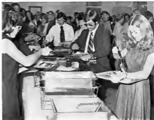
A popular event, the Sunday breakfast for seniors and their families attracted 700 hungry guests.