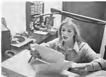
on Gardner-Webb radio WGWG-FM. The station is operated by the college as a public service.