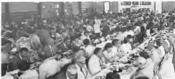
Over 600 alumni and friends filled the Charles L. Dover Student Center to renew friendships and