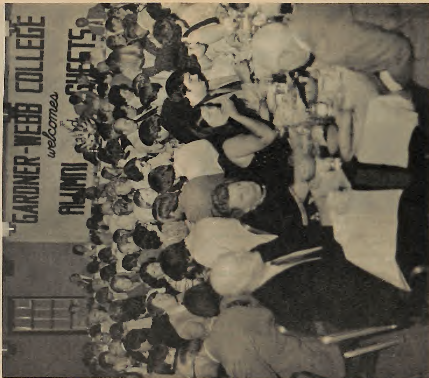
The annual Alumni Day activities are capped by the awards banquet that evening. Alumni Day this year will be Saturday, April 21. There will be some special events this year concerning the new Convocation Center. Please plan to attend. See page 6 for more details.