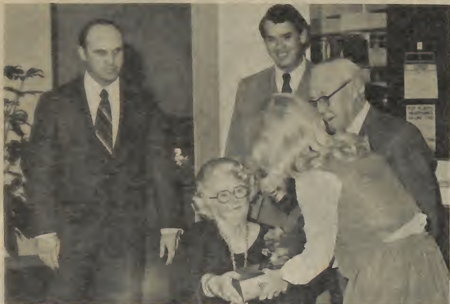
Presentation of 100,000th volume at Gardner-Webb.