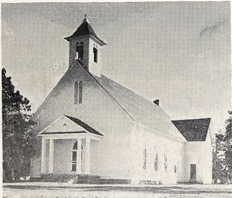
ROSS GROVE BAPTIST CHURCH

The Ross Grove Baptist church was organized September 1881