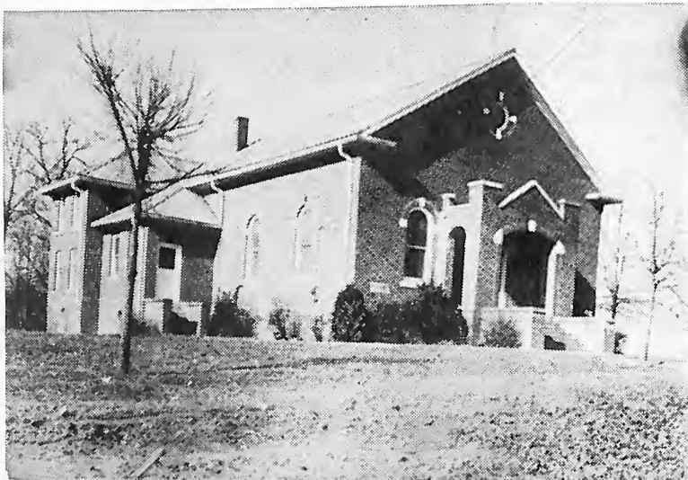
PLEASANT HILL BAPTIST CHURCH

The Pleasant Hill Baptist Church was constituted on February 7, 1851. There were 29 charter members, the most of them coming from the Zoar Baptist Church. The first building was erected in the fall of 1850. The second building was constructed in 1896. That building was reworked and the Sunday School plant was built in 1928. The Church has entertained the Kings Mountain Baptist Association the following dates: 1859, 1877, 1903, 1939 and 1951. It was delighted to have the Association meet the first day, October 25, 1951, because it was for both the Centennial year.