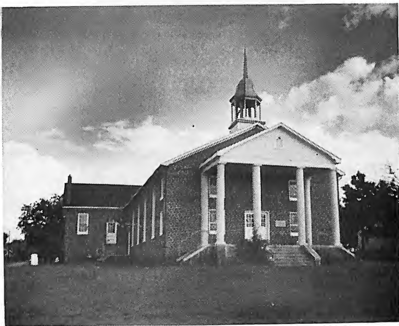
KINGS MOUNTAIN TEMPLE BAPTIST CHURCH