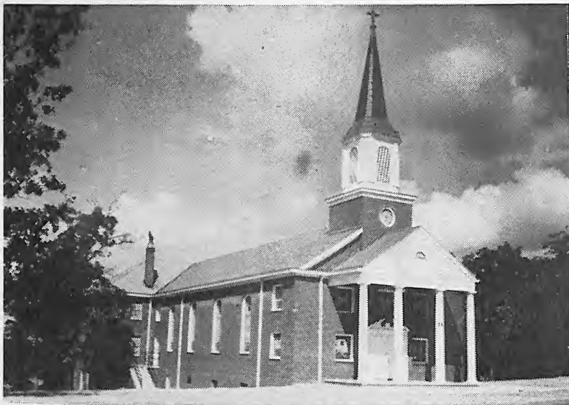
OAK GROVE BAPTIST CHURCH

The Oak Grove Baptist Church was constituted in 1897. This was the first time for the Church to entertain the Kings Mountain Baptist Association. This Church has a beautiful new Sanctuary.