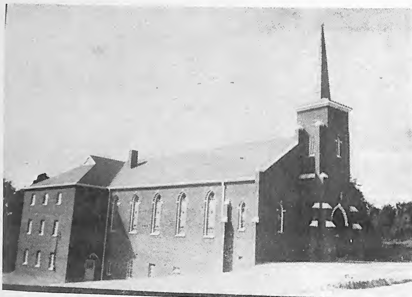
SECOND BAPTIST CHURCH, KINGS MOUNTAIN

The Second Baptist Church was organized in 1915. This was the first time for the Church to entertain the Kings Mountain Baptist Association. The Church had erected last year a spacious new building.