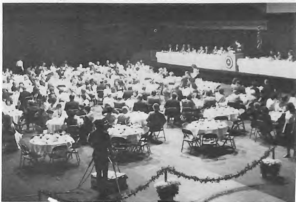
Those present for the "Roast" enjoyed an evening of good food and entertainment.