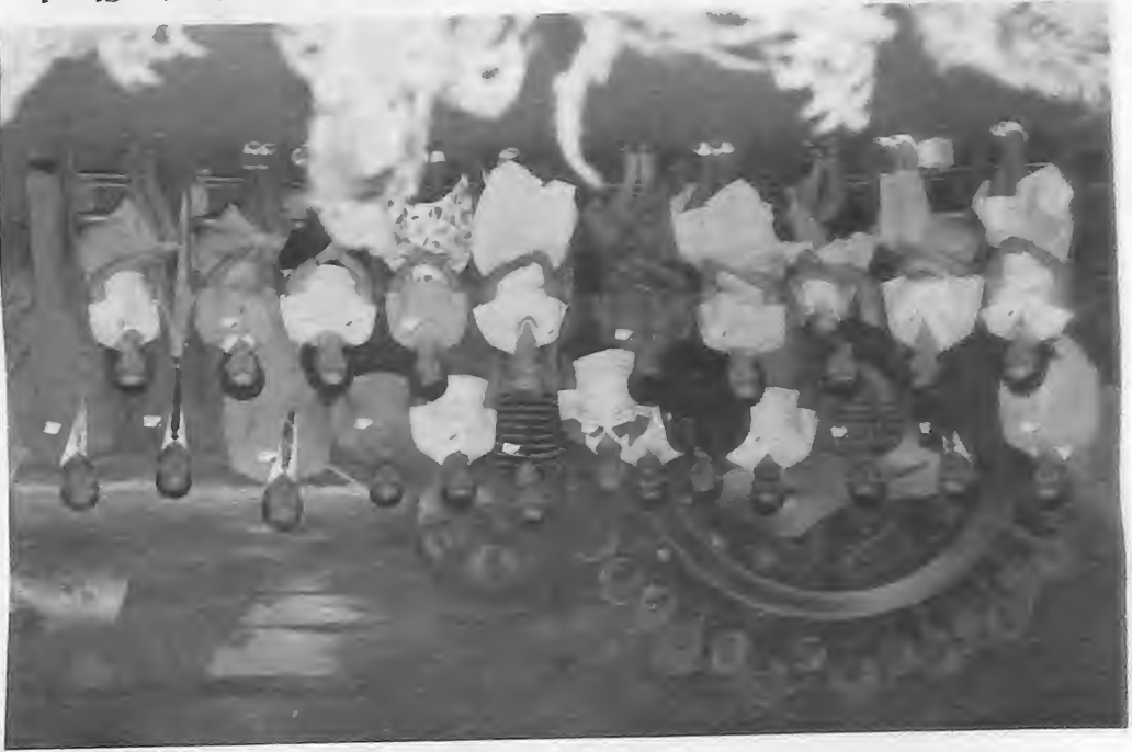
The class of 1975 celebrated their 10 year reunion in the Charles I. Dover building as part of the day's activities.