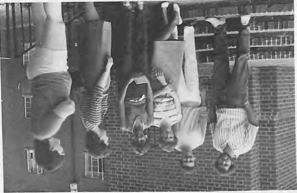
Members of the class of 1984 gathered at Dover Chapel for their reunion.