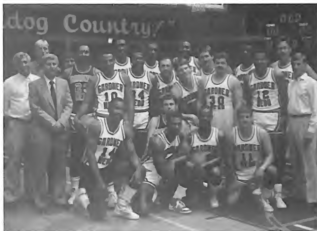
Ready for hoop action: the alumni basketball game