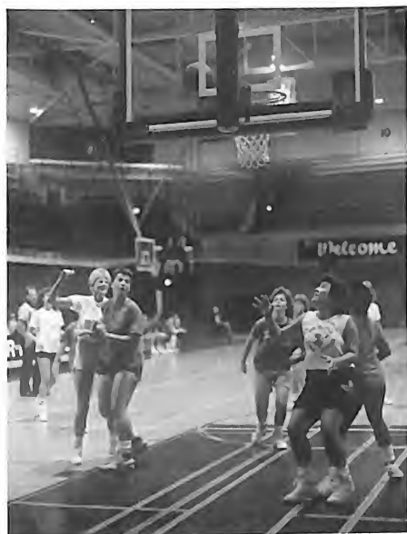
Making their shots: the alumnae basketball game