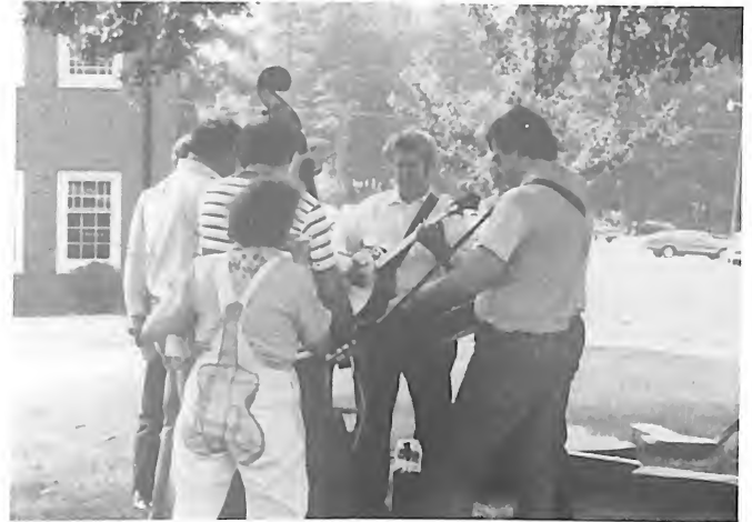
Musicians enjoyed "jamming" under the trees of the campus during the second annual Earl Scruggs Music Celebration.