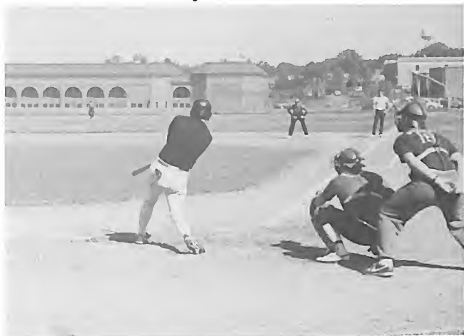
Slugging it out: the alumni baseball game