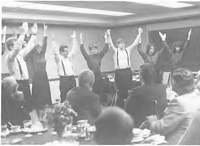
Signs Incorporated, G-W's sign choir, performed at the breakfast meeting for alumni attending the N.C. Baptist State Convention.