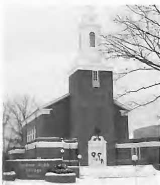
Front Cover: Gardner-Webb College campus in a blanket of snow.