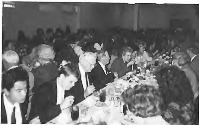
Donors and recipients enjoy the chance for fellowship.