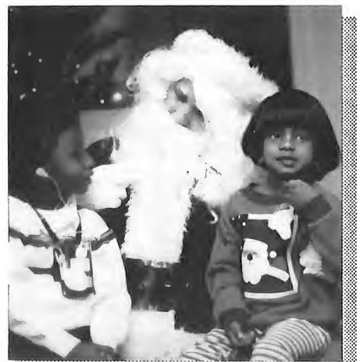
Preschoolers in the Program for the Deaf at First Baptist, Shelby, are shown with Gardner-Webb's very own Santa, played by a member of the Deaf Club. The children, who were entertained with a party, signed their wishes to Santa.