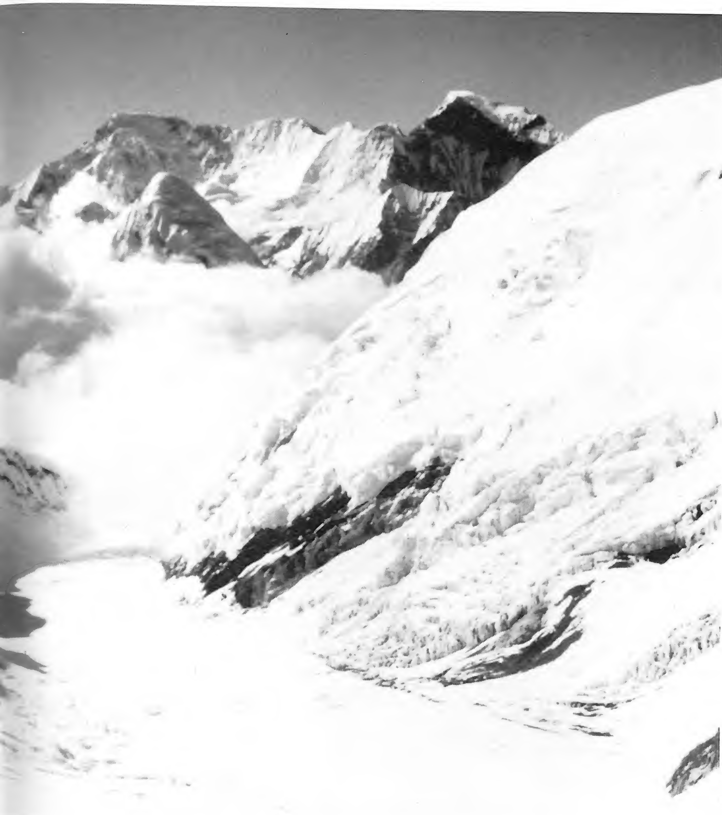
Shown here is the view from Dr. Perrin's highest point on Mt. Everest. In the center of the photo can be seen a glacier, which extends to the ice fields below.