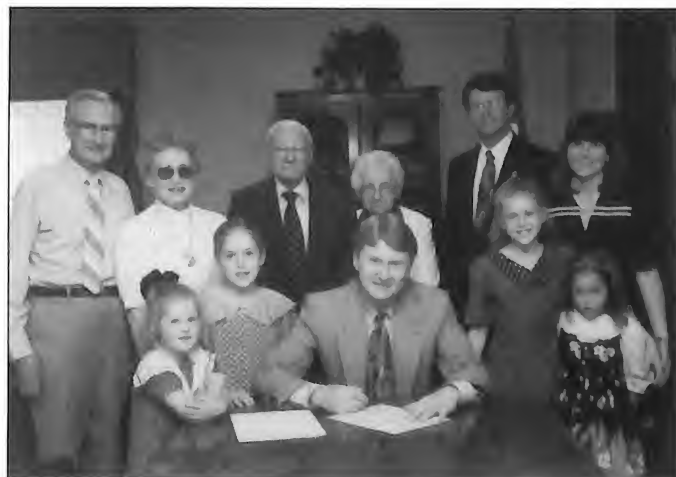
Family members gather to honor their association with Gardner-Webb