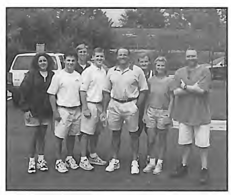
The GWU group poses with Carolina Panthers Head Coach Dom Capers (center).

Each member of the Gardner-Webb group was assigned to a photographer for the entire day of September 1, from dawn to dusk. The photographers were working on a project to produce a book that would tell the story of opening day in pictures. The book became available to the public in November. All facets of game day were caught on film, including the sunrise over the stadium, pre-game tailgate parties, player preparation in the locker rooms, fan participation, luxury box festivities, game action, and post-game activity.