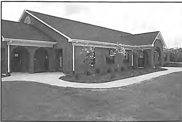
The new home offices for baseball and tennis