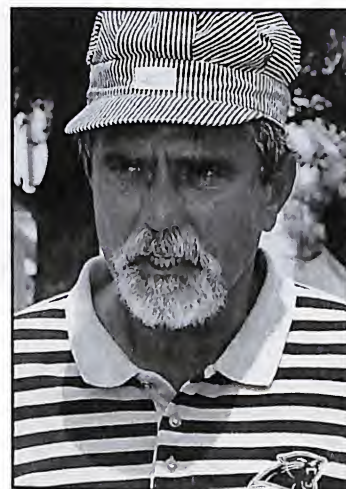
Former NFL great Roman Gabriel