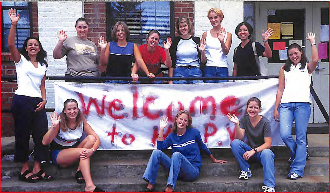
Smiles and waves invite new students to H.A.P.Y. Dormitory during the first week of the fall semester. Happy faces like these are made possible by gifts to the University from alumni and caring supporters.