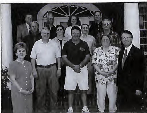
GWU new faculty at a recent gathering at the president's house