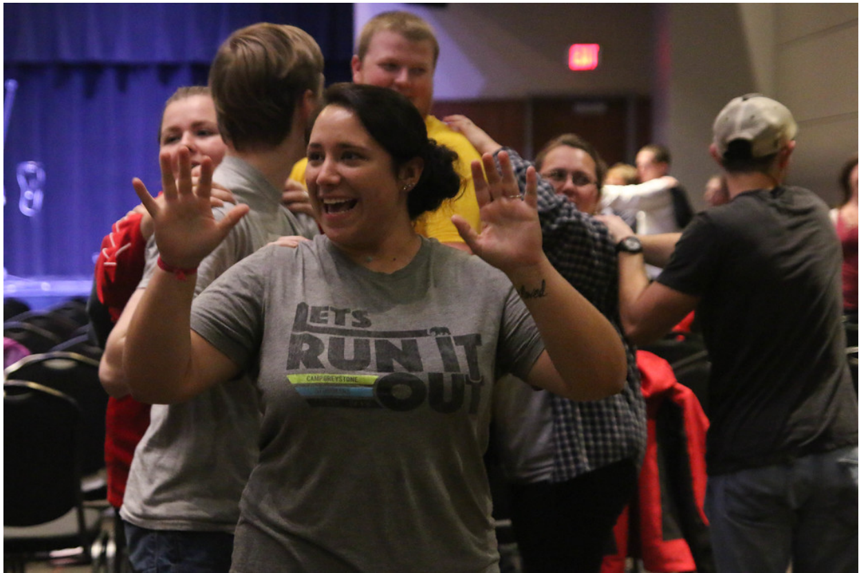
At the start of the CMU Fall Retreat on Friday night, September 25th, students played the game "Mingle" in order to meet and connect with new people.