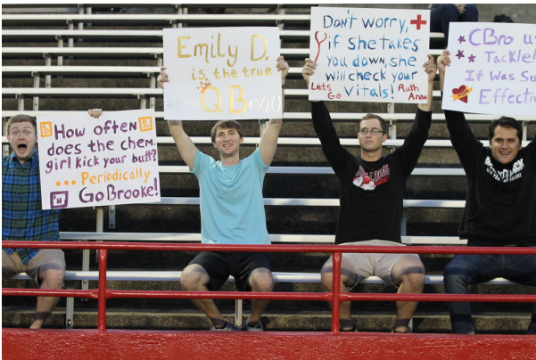
Fans in the stands supporting their favorite players.