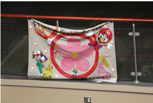
The Japanese Language and Culture Club won first place for their original banner.