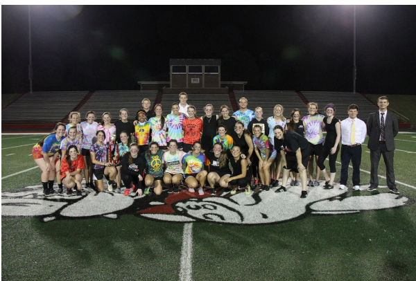
The annual powderpuff game took place in Spangler Stadium on Friday, Oct. 9.