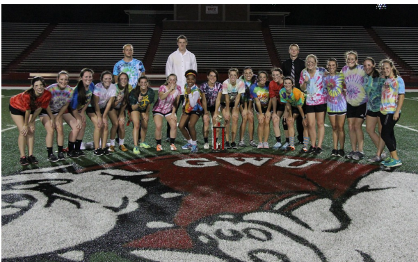
The Southside team took home the trophy.