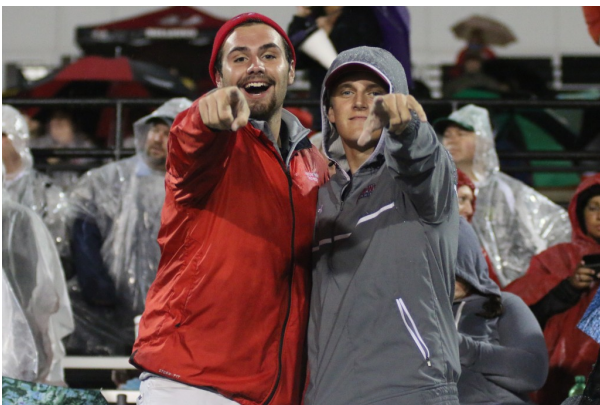
Fans supported the Runnin' Bulldogs despite the weather.