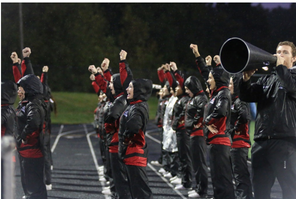
Cheerleaders in the stands supporting the Runnin' Bulldogs.