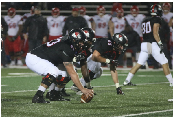
The Runnin' Bulldogs victoriously took on the Liberty Flames at this year's homecoming game and Big South opener, with a final score of 34-20.