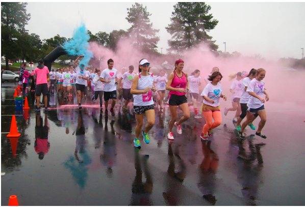
Despite the wet weather, runners greeted Saturday morning with a splash of color at the Color Dash.