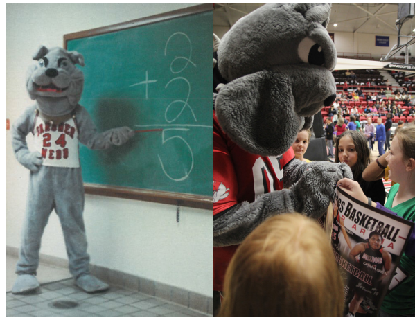
Bulldog mascot (left), 1985 Bulldog mascot (right), 2015

Orientation week is also a long-standing event at Gardner-Webb. Big brothers and sisters served to help freshmen become acclimated to college life both in 1985 and now in 2015.