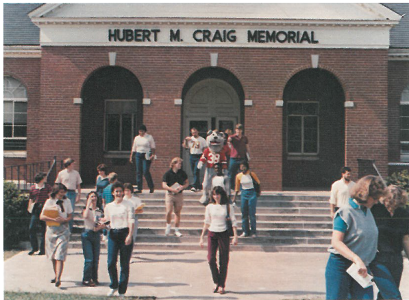
Craig Hall 1985

In 1955, Craig Hall still served as the Dover Memorial Library. It has since become the English building. In 1985, it bore a sign depicting its full name, Hubert M. Craig Memorial.