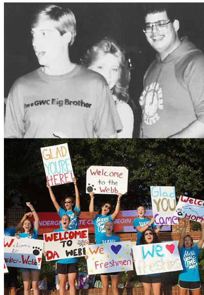
Orientation, 1985 (top) Orientation, 2015 (bottom)

Orientation week is also a long-standing event at Gardner-Webb. Big brothers and sisters served to help freshmen become acclimated to college life both in 1985 and now in 2015.