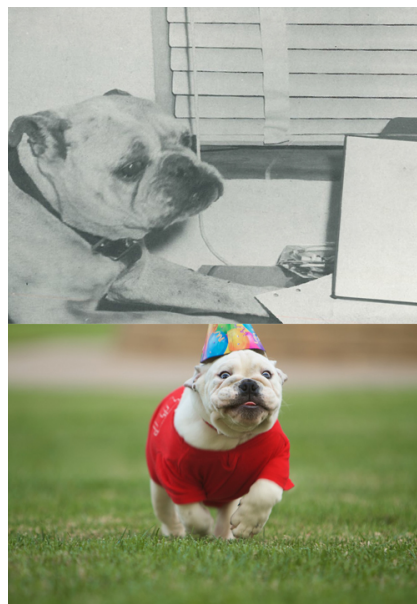
Butch (above), 1954 Roebuck (below), 2015

Mascots, both animate and otherwise, have long been a proud tradition at Gardner-Webb. Butch the Bulldog lived until 1954, while a costumed bulldog helped raise spirits in 1985. Now in 2015, Roebuck the Bulldog has become the new face of Gardner-Webb athletics, along with a new version of the Bulldog suit.