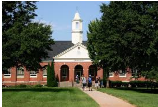
Craig Hall 2015

Hamrick Hall is the third building to stand on its current site. The one pictured here was the replacement for Memorial Hall, which burned down in 1937. The current building was built after yet another fire claimed the second.