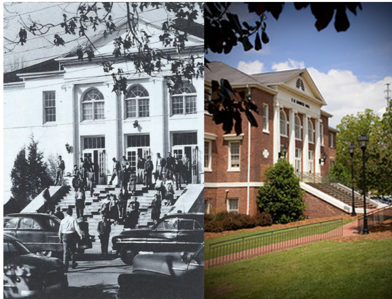
Hamrick Hall 1955 and 2015