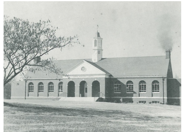
Craig Hall 1954