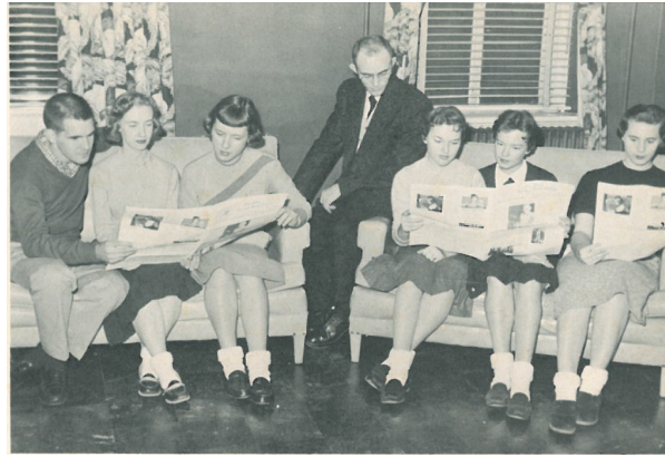
Students reading The Pilot in 1956.

In 1955, Craig Hall still served as the Dover Memorial Library. It has since become the English building. In 1985, it bore a sign depicting its full name, Hubert M. Craig Memorial.