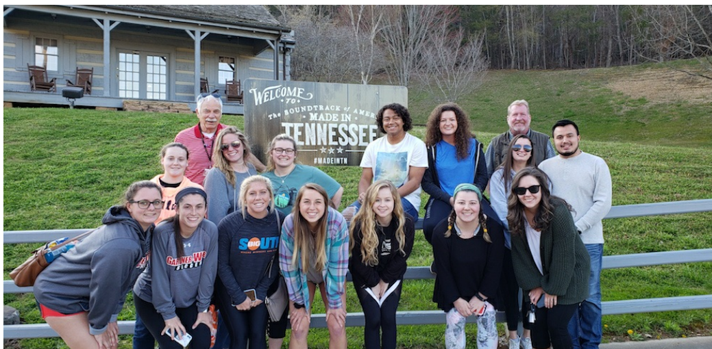
Honors Students from Gardner-Webb University attended the Southern Regional Honors Council 47th Annual Conference recently.

BOILING SPRINGS, N.C.—Honors students from Gardner-Webb University recently traveled to Memphis, Tenn., to participate in the Southern Regional Honors Council (SRHC) Conference. The 47th annual meeting was hosted by Northwestern Louisiana State University (Natchitoches). The SRHC promotes and advances honors programs and honors colleges in the Southern United States and has over 100 member institutions.