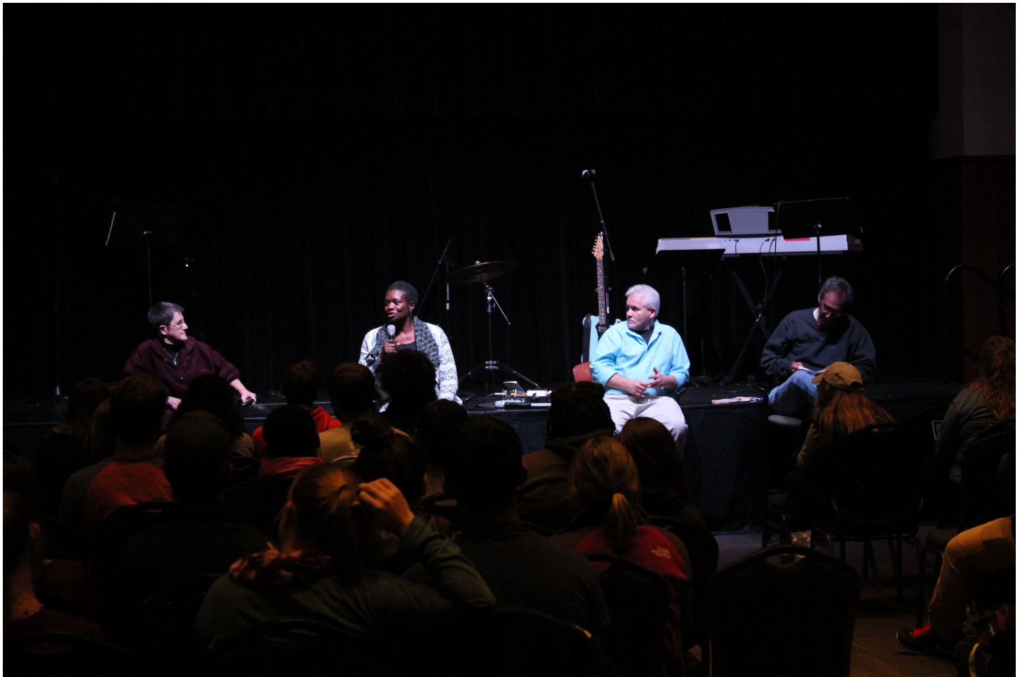
Five people from Miracle Hill Ministries spoke about their experiences with homelessness on Tuesday during the Gathering.