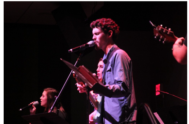
After worshipping, the students were able to hear about how the Lord worked in the lives of women and men who experienced homelessness.

Students also had the opportunity to ask the panel additional questions once everyone on the panel had shared their testimonies.