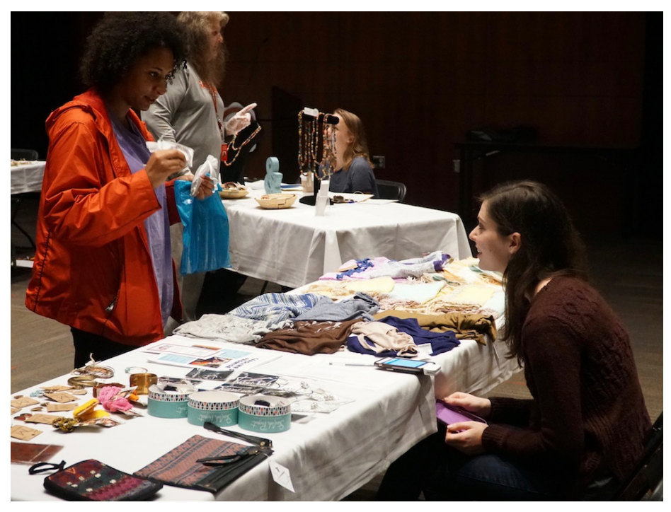
Fair Trade products combat human trafficking through business models that provide fair wages and safe working conditions for workers.