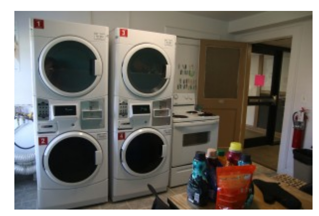
Residents of HAPY share four laundry machines.

Respondents also noted that HAPY's lobby, located within the female area of the building, is a big an issue. Chris Beguhl, a junior, said that, "the lobby is shared with the female wing, and is only accessible by getting a female resident to let you through or by going outside about 40 feet."