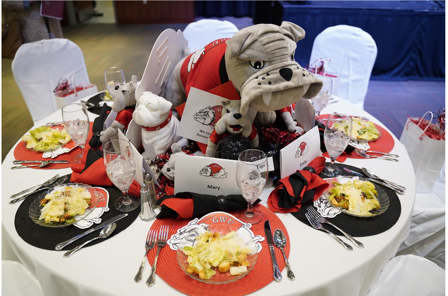
The 3rd Annual Parade of Tables: Benefitting the Little Bulldog Backpack Program

BOILING SPRINGS, N.C. – The Little Bulldog Backpack Program will be hosting the fourth annual Parade of Tables on Saturday, Feb. 8, 2020, at 6 p.m. in the Tucker Student Center at Gardner-Webb University.