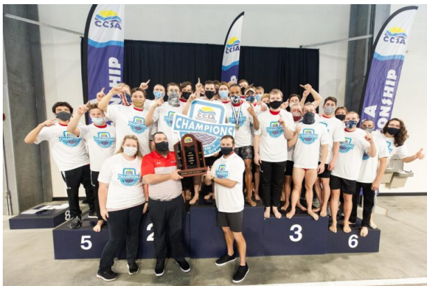
Gardner-Webb men's swimming has been crowned as the 2021 CCSA Conference Champions. Taking home first place, the men racked up a grand total of 1,059 points over the three-day meet.

For the first time ever in program history, Gardner-Webb men's swimming has been crowned as the 2021 CCSA Conference Champions. Taking home first place, the men racked up a grand total of 1,059 points over the three-day meet.