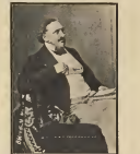
A PHOTOGRAPH OF THE AUTHOR

THE REV. MR. [Name] will be the first of the series of lectures on the history of the city of London, given by the Rev. Mr. [Name]. The lecture will be held at the [Location] on [Date]. The lecture will be held at the [Location] on [Date].