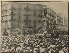
Musical To A Fair Musician

THESE are a series of 100 musical pieces, arranged in a way that makes it possible to play them from the beginning of the first measure to the end of the last measure. They include a number of the most popular favorites ever composed, and are arranged in a way that makes it possible to play them from the beginning of the first measure to the end of the last measure.