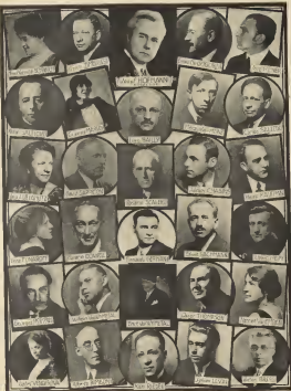
Faculty of The Curtis Institute of Music