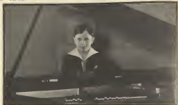
THE NEW PROGRAM AND THE PIANO

Illustration accompanying this page. The girl is not actually playing the piano, which has been brought in from the studio of the author. The piano is a new model, and the girl is a member of the class.