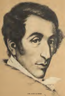
CARL MARIA VON WEBER