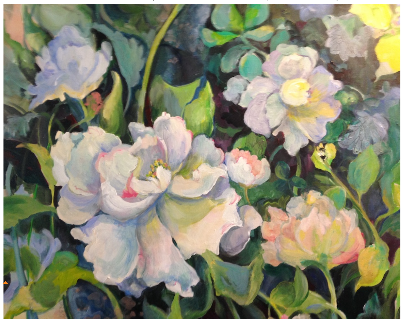
Bountiful II, acrylic