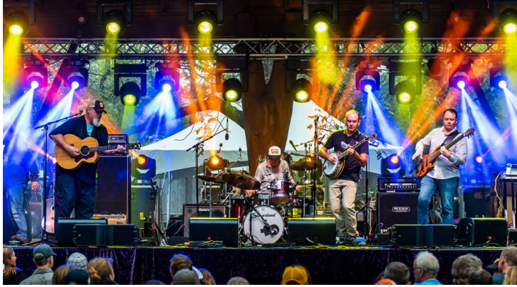
▲ Acoustic Syndicate