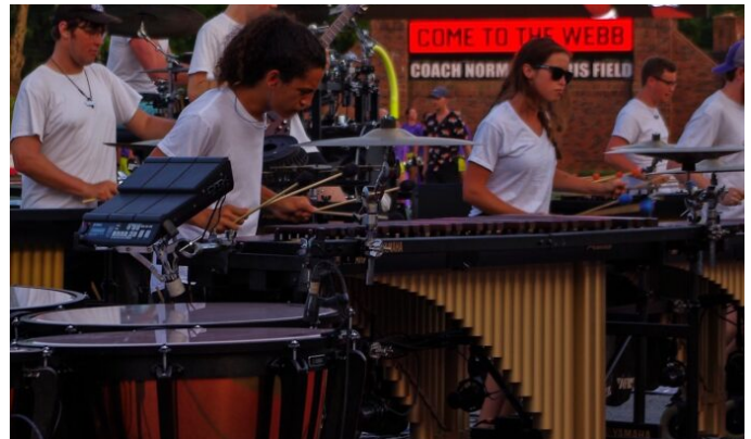
▲ Members of the Carolina Crown Drum and Bugle Corps practice their 2022 show, “Right Here, Right Now.”