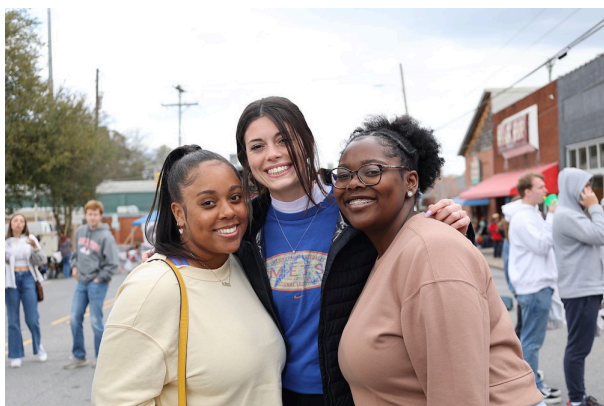
▲ Students enjoy WoodStock 2022, hosted by the town of Boiling Springs and Gardner-Webb University in April.