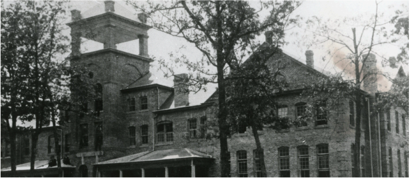
▲ The Huggins-Curtis Building

BY OFFICE OF UNIVERSITY COMMUNICATIONS ON AUGUST 18, 2022