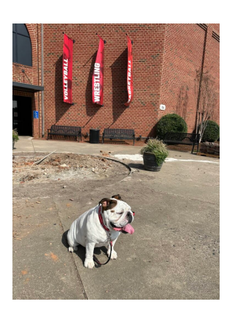
Bo waits for the new sculpture to be delivered to campus.